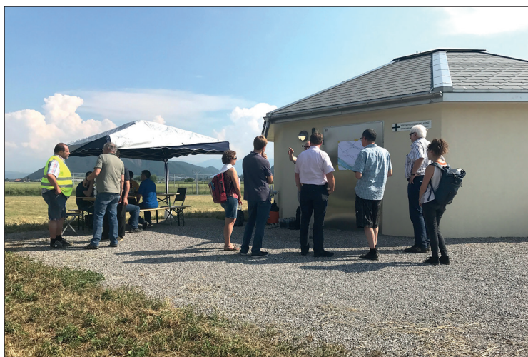
Possible applications in ground water